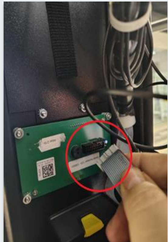
Above: Example LCD connection on Crane Merchant 6 vending machine